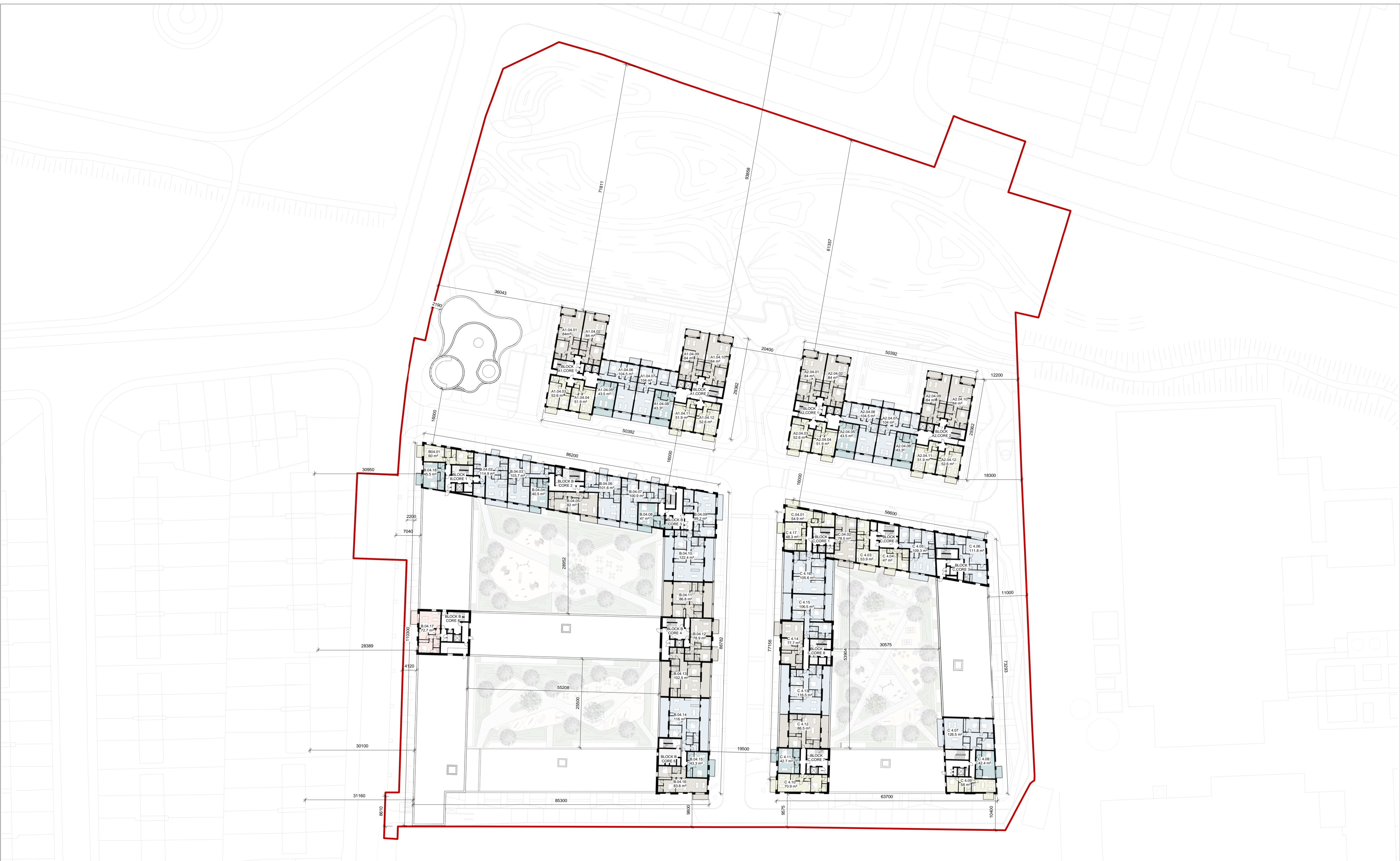
1 04 Fourth Floor Level 1 : 500